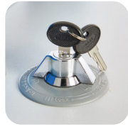
Dual point locking Key system.