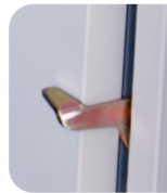
Concealed handle to power compartment.