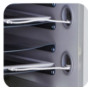
Cable clip portholes to gether excess cables.