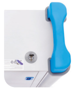
Ergonomic ABS handles.