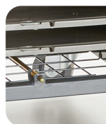
Fully welded steel frame with weldmesh base for constant air flow.