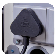
Device adaptors plug into 2x8-way power strips.