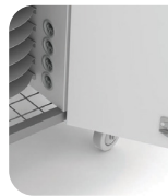
Wide opening doors, open to 180 degrees.