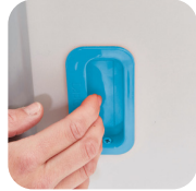
Inset door handles.