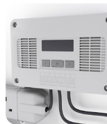
Power 7 Management System manages the power consumption.