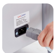
IEC socket with 1.8m designed to snap out if pulled away.