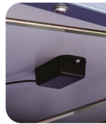
Built-in heat sensor will shut off power if a device overheats.