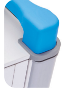
Rounded corner extrusions and rubber corners.