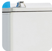
Strong MFC cladding.