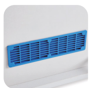
Well placed vents allow constant air circulation.