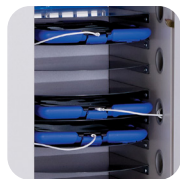
Individual fixed shelf compartments.