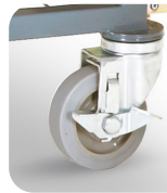
Non-marking hospital grade rubber wheels.