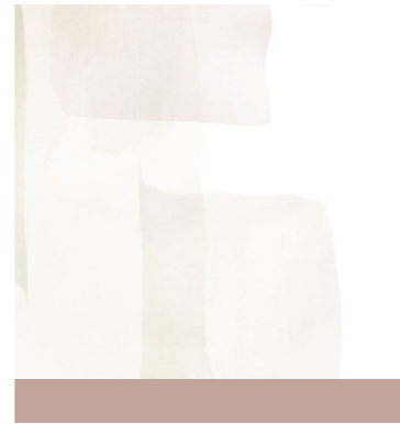
• Veil Rose