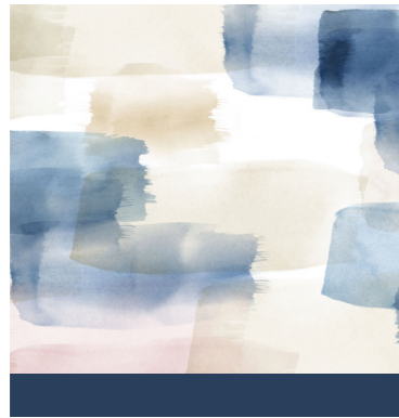
• Lakeside Daydream