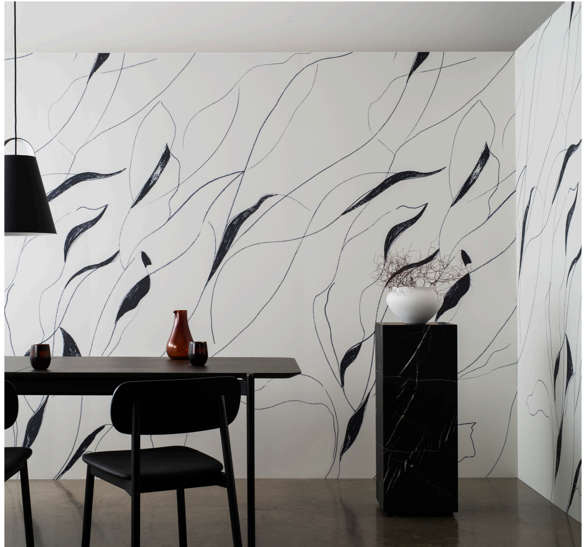
● Vine Charcoal