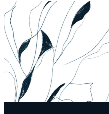
• Vine Charcoal